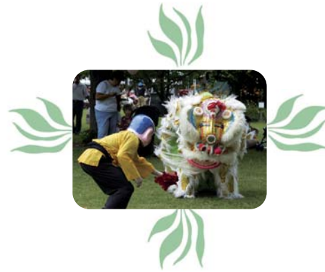
Cover Painting: LAFAYETTE