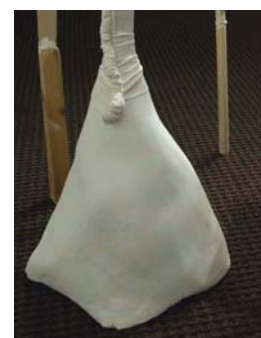
STEPHANIE BROOKE WEST